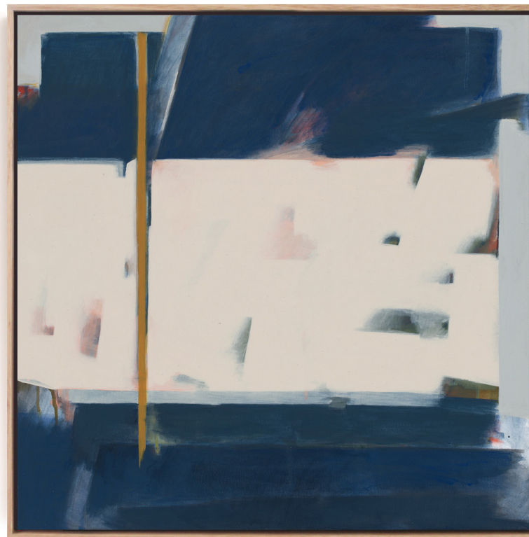
The Light Within

610 x 610mm Acrylic on Canvas Framed in Tasmanian Oak