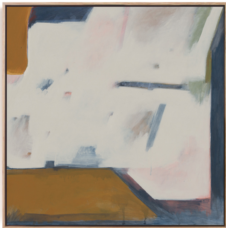
A New Perspective

610 x 610mm Acrylic on Canvas Framed in Tasmanian Oak